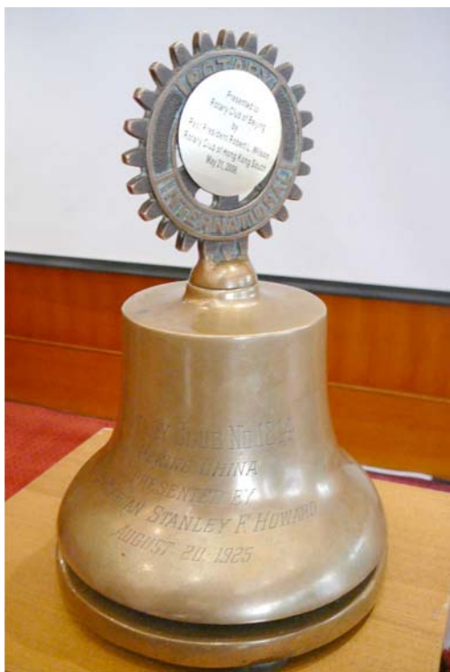
The Beijing Club's famous bell dated 1925