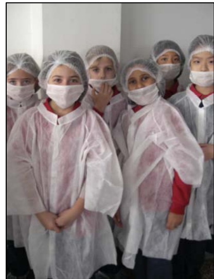
Yr4 dressed in their sterile clothing