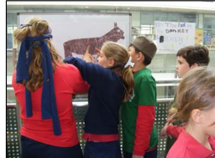
Pinning the Tail on the Donkey